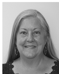
Parris Bayesa Elem. Music